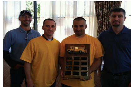
Golden Bucket Winners